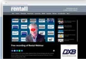
The Webinar recording will be made available post event on khl.com and our youtube channel.