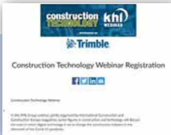
KHL webinar zoom registration email with your branding